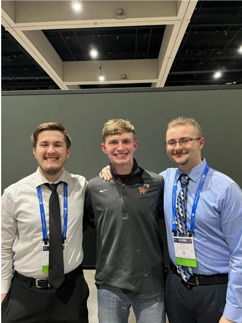
(This is a picture of the guys I went to high school with)