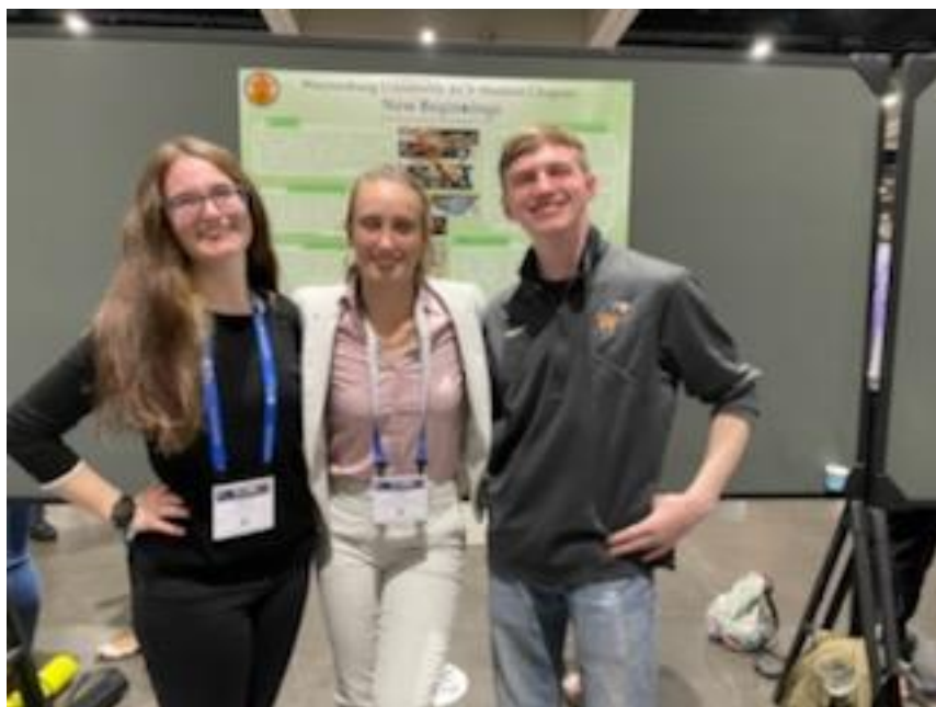
(This is a picture of all the students who went from my school)